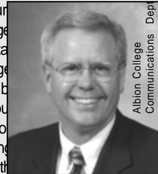
Albion College Communications Dept.