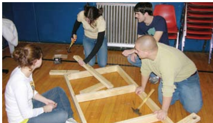
Ford students lending a hand in Detroit.